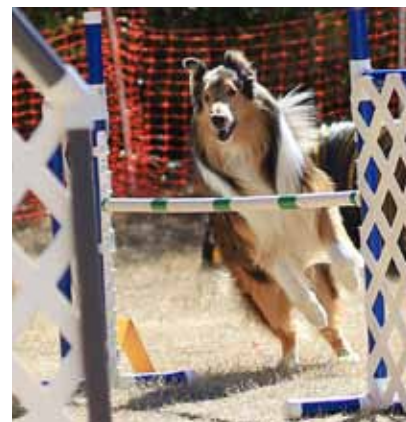
Rainier Agility Team